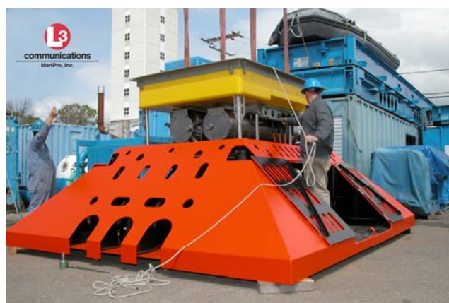
Figure 3. ROV serviceable science node being lowered into trawl resistant frame (MARS node by L3 MariPro)