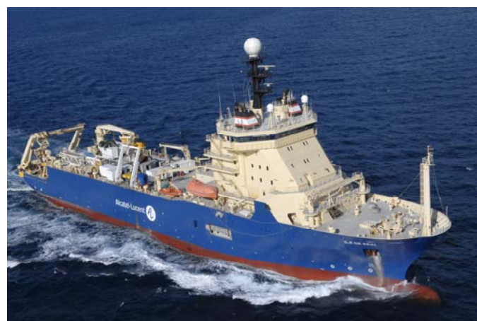
Figure 5. Alcatel-Lucent's Ile de Sein cable ship, 140 m in length, which is installing the backbone in fall 2007