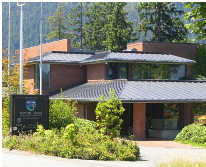
Figure 2. NEPTUNE Canada's shore station at Port Alberni

Technical details of the infrastructure are provided by the papers by Phibbs, Lentz and Jones elsewhere in this MTS-IEEE Oceans 07 proceedings volume, with a paper covering the details of the science program by Best.